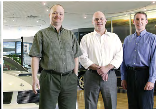
Dick Hannah Dealerships 1,000 Employees | Customer since 2005 | Private Line - Ethernet - T1