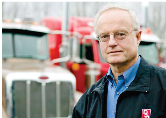
DSU Peterbuilt & GMC 210 Employees | Customer since 2003 | Basic Voice