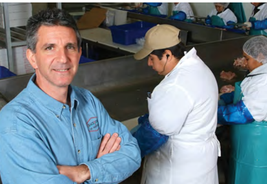
Grace Foods, Inc. 30 Employees | Customer since 1998 | Internet T1